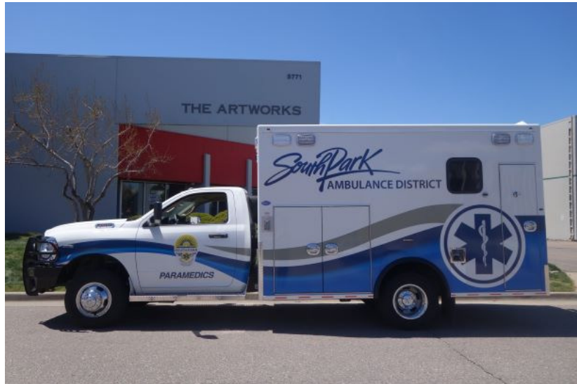
New Ambulances / Entering Service June 2020