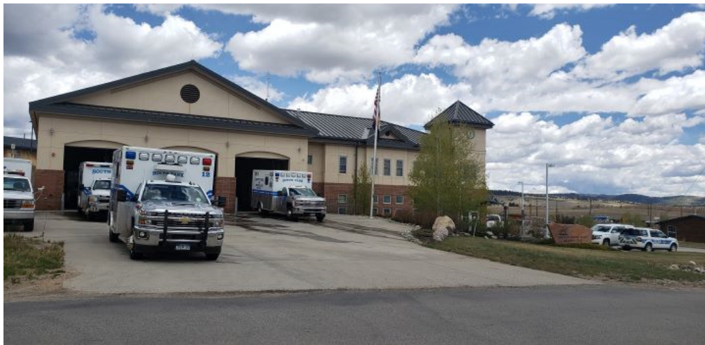
Headquarters Station, Fairplay