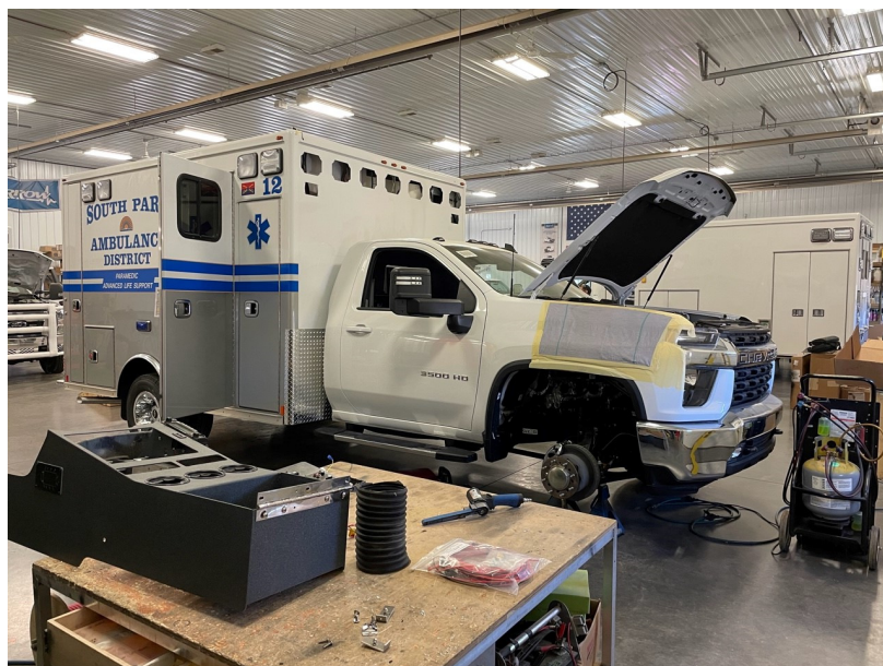
2019 Box Remount on 2021 Chassis Progress 3/8/21