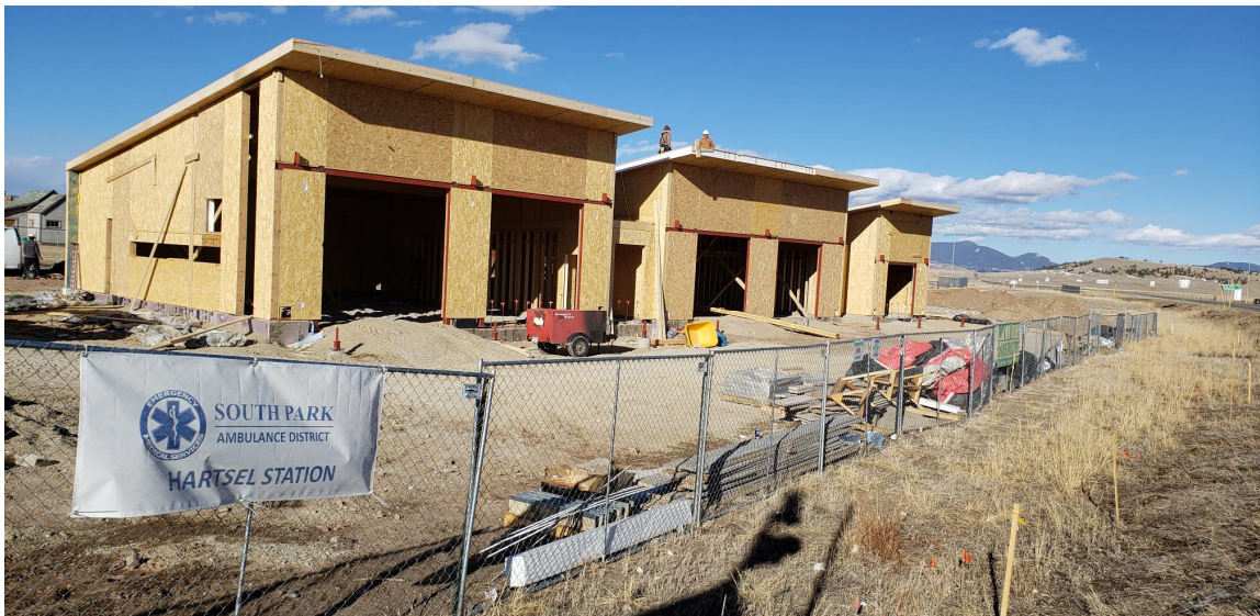
Construction Progress 3/8/21