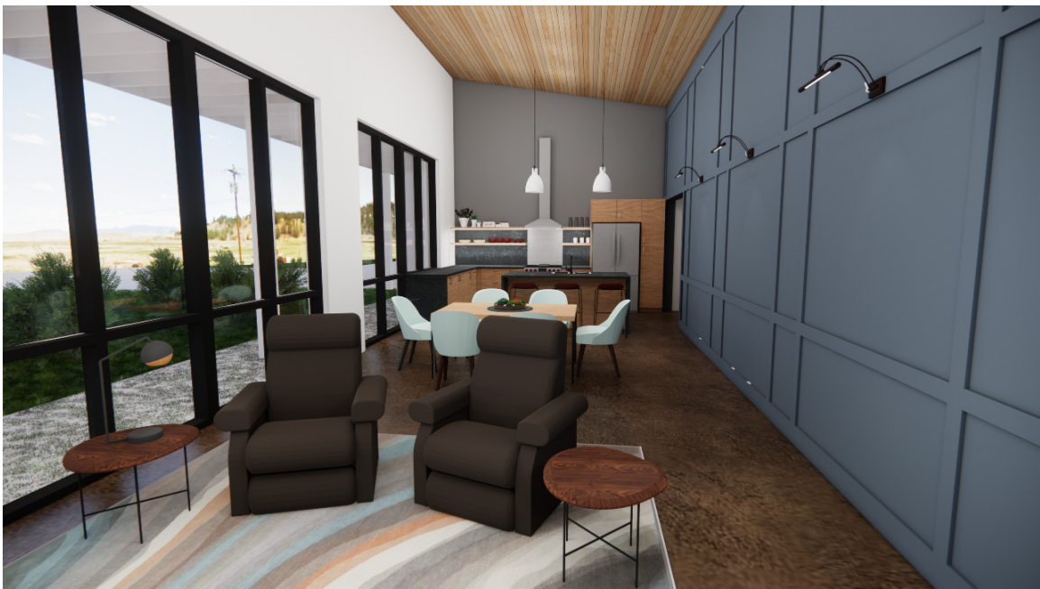
Rendering of New Station Crew Ready Room