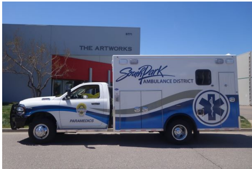
Braun Northwest Entered Service June 2020