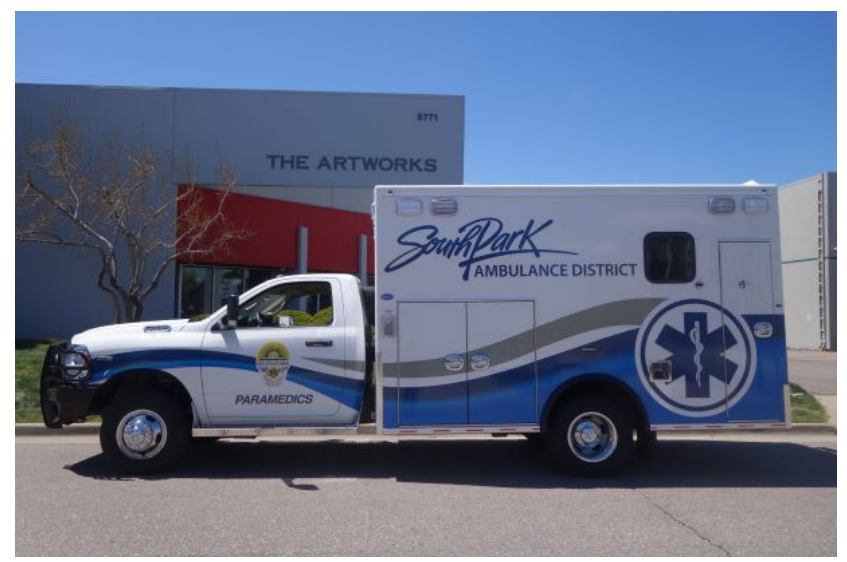
Two Braun Northwest Entered Service June 2020