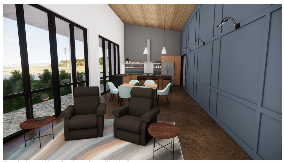
Rendering of New Stations Crew Ready Room